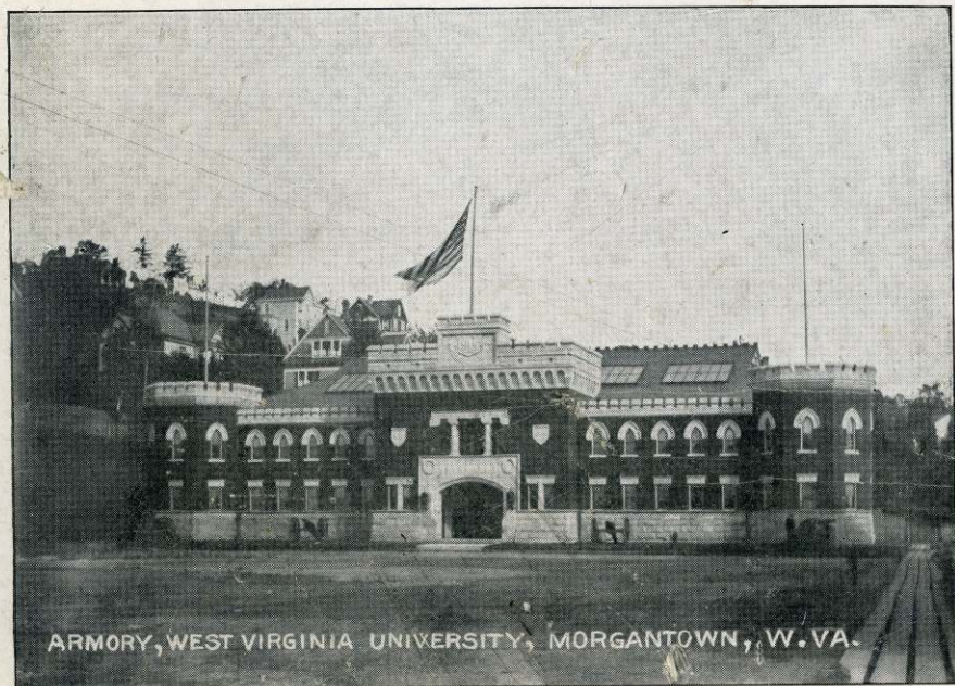
ARMORY, WEST VIRGINIA UNIVERSITY, MORGANTOWN, W.VA.