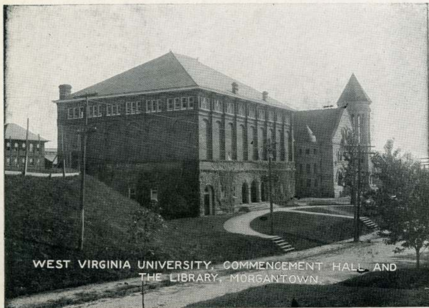
WEST VIRGINIA UNIVERSITY, COMMENCEMENT HALL AND THE LIBRARY, MORGANTOWN.