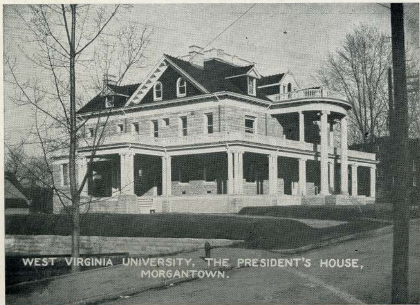
WEST VIRGINIA UNIVERSITY, THE PRESIDENT'S HOUSE, MORGANTOWN.