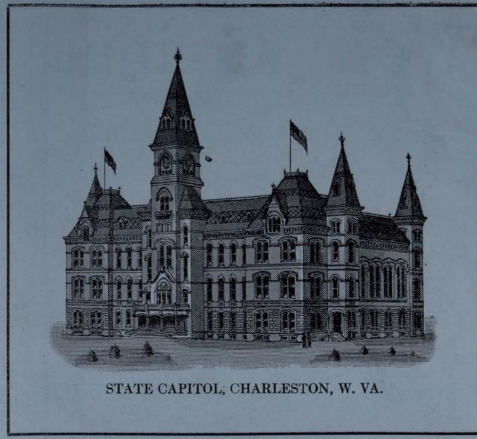
STATE CAPITOL, CHARLESTON, W. VA.